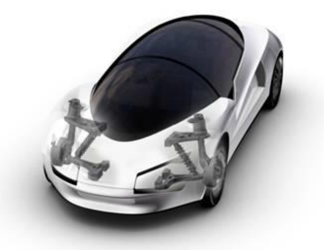
Fig. 1: Research vehicle SpeedE with front suspension and steering actuators

The research vehicle SpeedE has been developed by the Institute of Automotive Engineering (ika) at RWTH Aachen University since 2011. By putting innovative features of electric vehicles into focus of the design process, the prototype shall display the advantages of this vehicle type beyond zero emission driving. For ika and its partners like Forschungsgesellschaft Kraftfahrwesen mbH Aachen (fka) it is a platform to show new ideas for systems and components, independent of any car manufacturer. The revolutionary design has been developed in cooperation between ika and the School of Design of Pforzheim University. Financial support for this project is offered by the foundation Hans Hermann Voss-Stiftung.